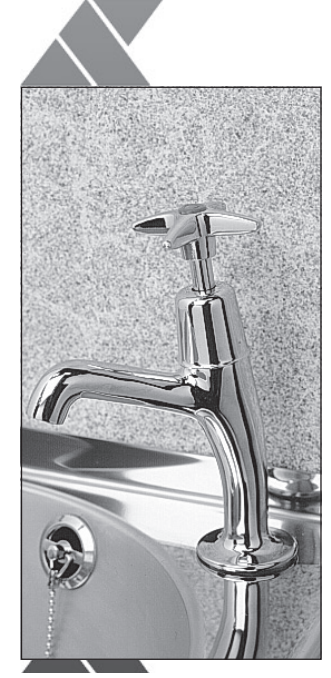
High Neck Sink Tap Product Code □6712HNSHC-high neck sink tap - pair