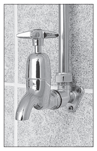
Bib Cock Tap Product Code □6713BCHC-bib cock tap - pair

Designed and manufactured to British Standard 5412, the cross head tap is ideal where an easy grip for on/off control is required. All taps in the range are manufactured from solid brass and finished in a high lustre chrome. Supplied in pairs, the taps are available in pillar, high neck and bib cock designs, all of which have a 12 mm (1/2 in) BSP male inlet connection.