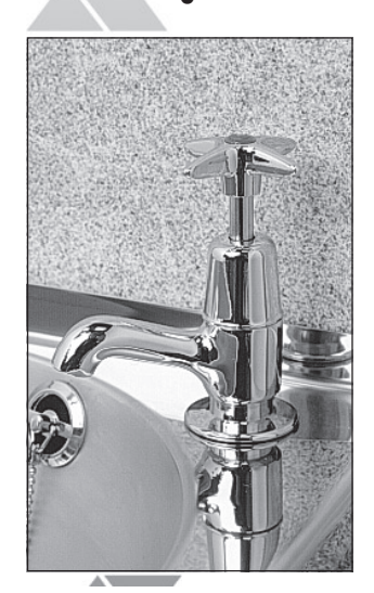
Basin Pillar Tap Product Code